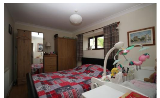
The Old Brewhouse Bath, BA1 4EP