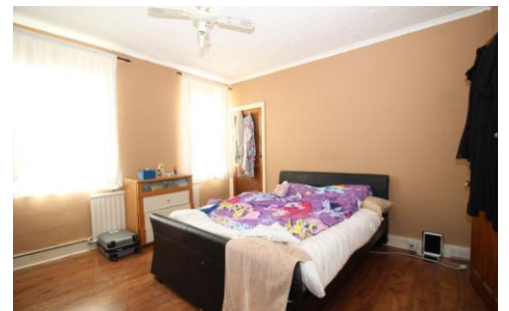
Coronation Villas Radstock, BA3 3JD