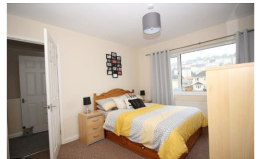
Georgian View Bath, BA2 2LZ