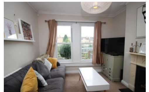
Highland Terrace Bath, BA2 3RN