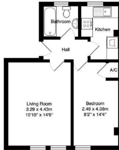
Flat 1, 5 St. James's Street