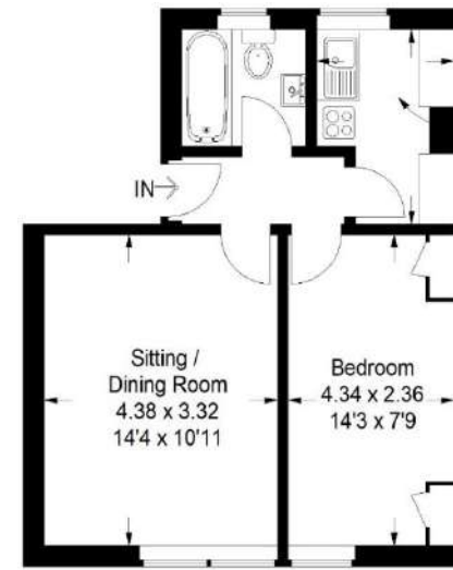
Flat 2, 5 St. James's Street