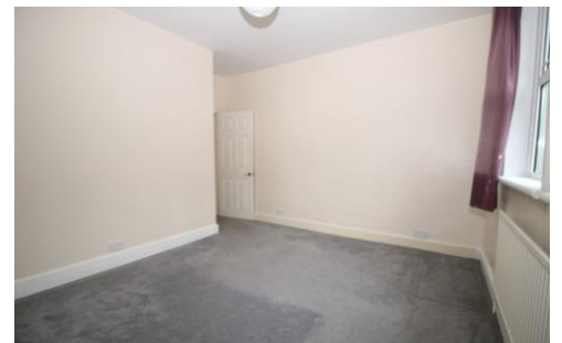
Ivy Lodge Bath, BA1 3AJ